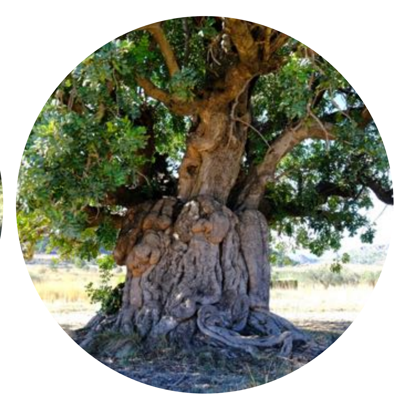
Generically protected carob tree due to the size of its trunk (circumference 6.50 m), in Pla de l'Assut, in Montroi (Valencia).