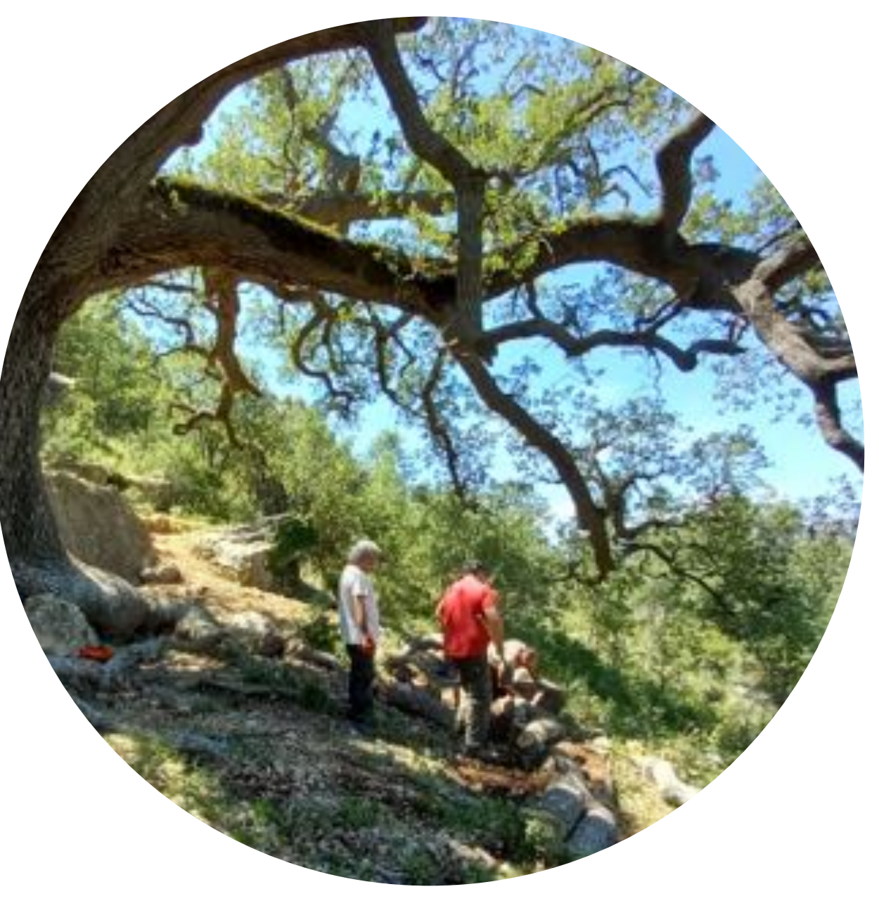
Construction of a wall made of branches interlocked with stones to retain soil and runoff water and prevent the passage of people, in «Roure de la

Roca», in Barranc dels Horts (Ares del Maestre, Castellón).