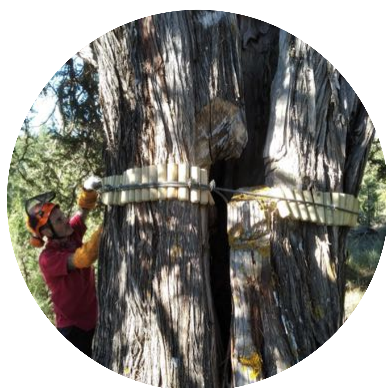
Old Juniperus thurifera in Cañadillas area (Puebla de San Miguel, Valencia). Its use as a beehive and the carved steps eventually caused the trunk to split. To prevent complete breakage, the tree was supported with static cabling, and two markers were placed to monitor the size of the fissure

Roca», in Barranc dels Horts (Ares del Maestre, Castellón).