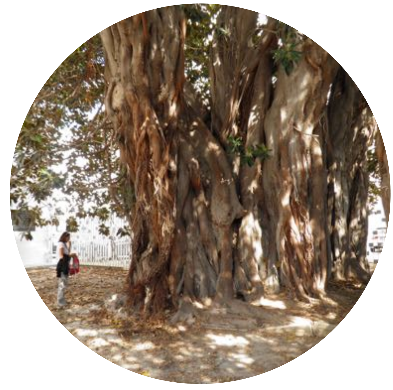
«Ficus de Benalúa» in Alicante, the largest trunk size specimen in Valencian Community (circumference = 14.69 m). In 2017, environmental improvement work was carried out, removing the pavement that restricted root growth, gas exchange, and water absorption.