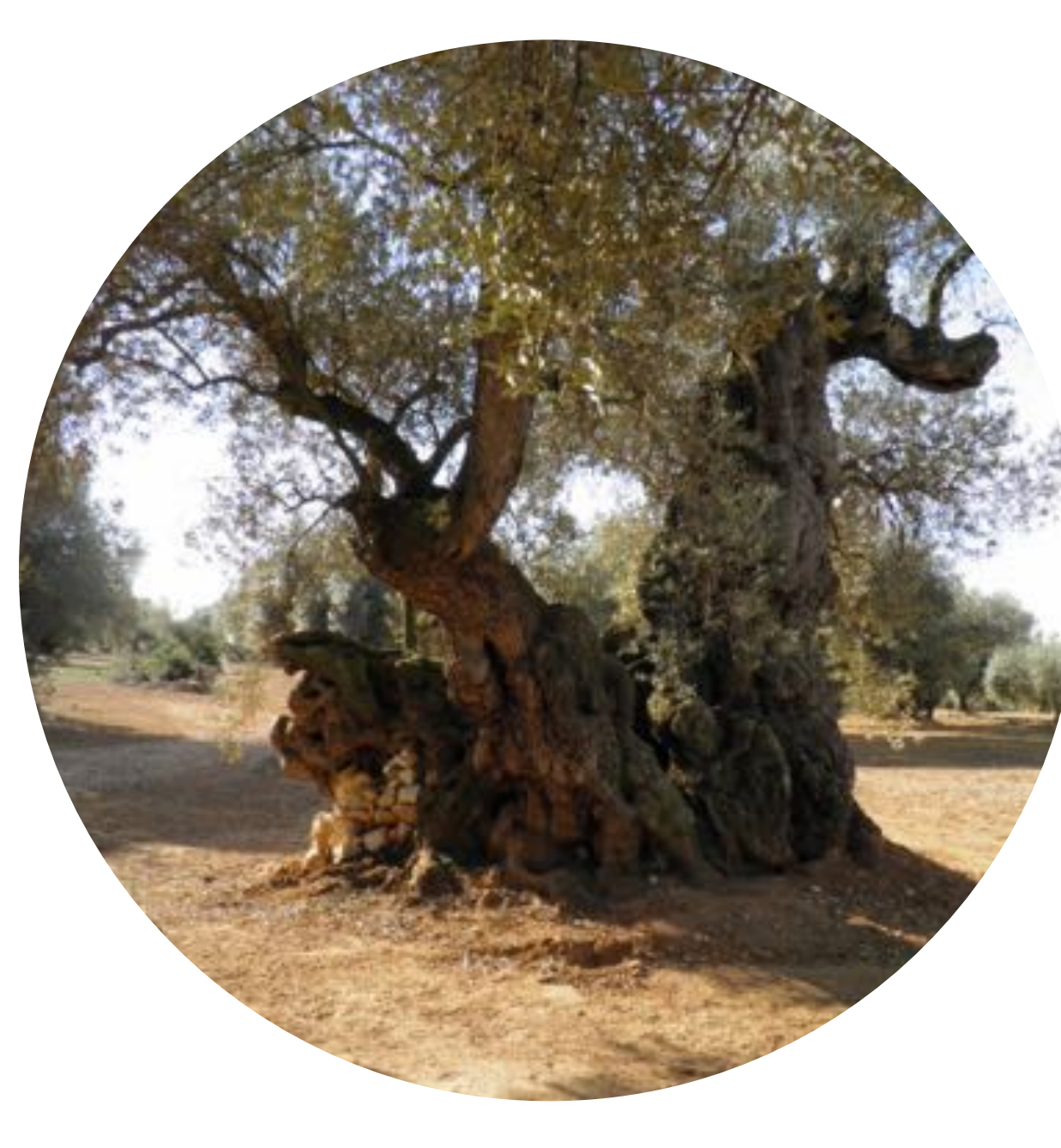
Olive tree in the northernmost part of the province of Castellon, in the recently designed by FAO as GIAHS (Globally Important Agricultural Heritage Systems) «Olivos Milenarios Territorio Sénia».